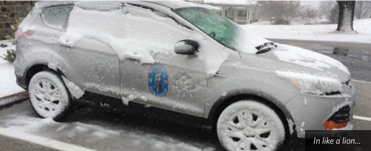
In like a lion...

A Quarterly Newsletter to the Citizens of Westtown Township - Spring Issue #25