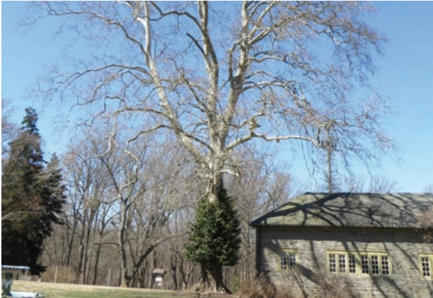
Oakbourne's record holding London Plane tree

In the London Plane tree picture, note the bushy evergreen growth on the main trunk of the tree. This is mostly an euonymus vine, which over the years has worked its way up the tree. Deer love to eat euonymus leaves, hence the vine's leaves start about 5-6 feet above the ground.