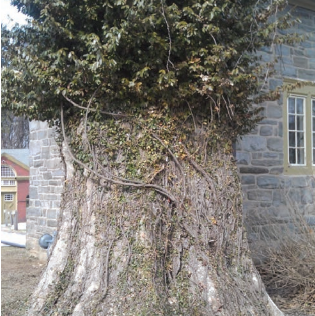
Euonymus vine on London Plane tree

In the London Plane tree picture, note the bushy evergreen growth on the main trunk of the tree. This is mostly an euonymus vine, which over the years has worked its way up the tree. Deer love to eat euonymus leaves, hence the vine's leaves start about 5-6 feet above the ground.