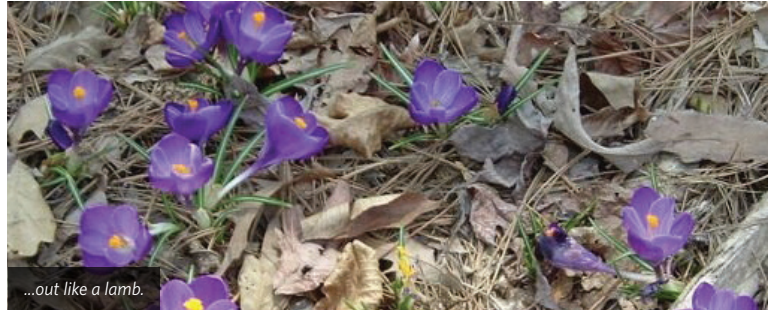
...out like a lamb.