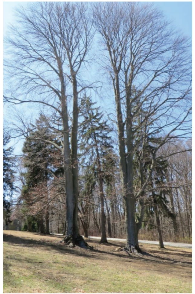
Two remaining Copper Beech Trees

Finally, we bid a sad farewell to two magnificent copper beech trees that had become diseased over the last several years. These trees, located in a grouping of four old copper beeches situated on the left along the park's entry drive, had become hazardous and were taken down by a tree service. I believe that this grouping of trees is close to 150 - 200 years in age; two trees of this grouping remain, so look for them as you enter the park about halfway up the driveway on your left. Several years ago, FoO started planting another grouping of copper or purple beeches near the originals to replace them.