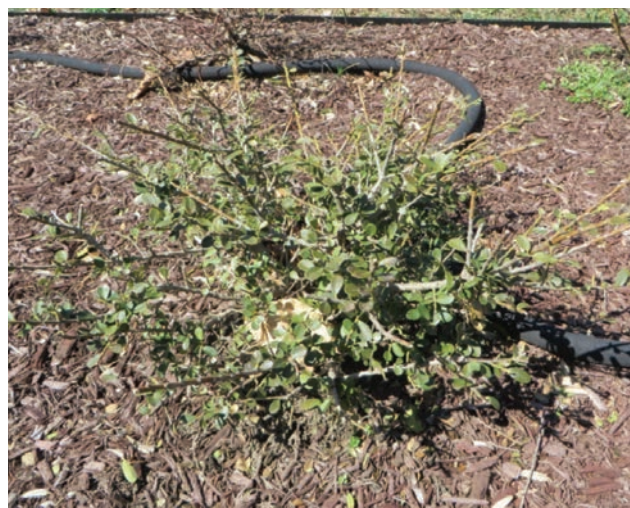
A deer nibbled holly in the Clock Garden

On my park walk-about in early April, it appeared that all of the trees that were planted last year came through the winter just fine. In particular, the 19 individually fenced trees that were planted along the park's entry drive escaped damage from deer. It's still too early to see if all are viable, but they look to be in good shape. On the other hand, the "deer resistant" holly plants FoO installed in the Clock Garden did not escape being grazed. Virtually all of the tips of each of the holly branches had been nibbled off; note that these hollies are classified as deer resistant, not deer proof! And while the deer did not bother the newly planted hollies during the summer, they did eat the tender holly terminal shoots when food became scarce during the winter. The lavender (deer don't like strongly aromatic plants), as well as the barberry and knockout roses FoO planted, did not appear to be touched during the winter. Actually, the deer may have done us a favor with the hollies, since we were going to prune them in April to stimulate branching during the summer growing season.