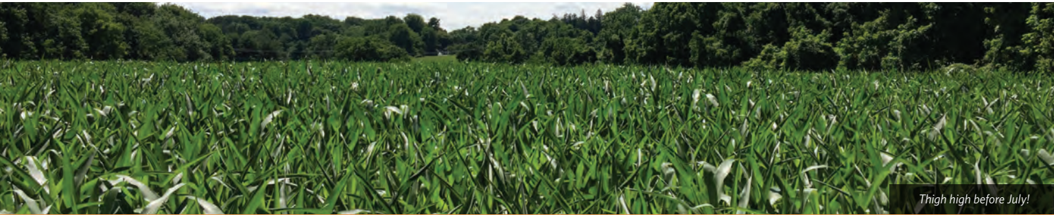
Thigh high before July!

A Quarterly Newsletter to the Citizens of Westtown Township - Summer Issue #26