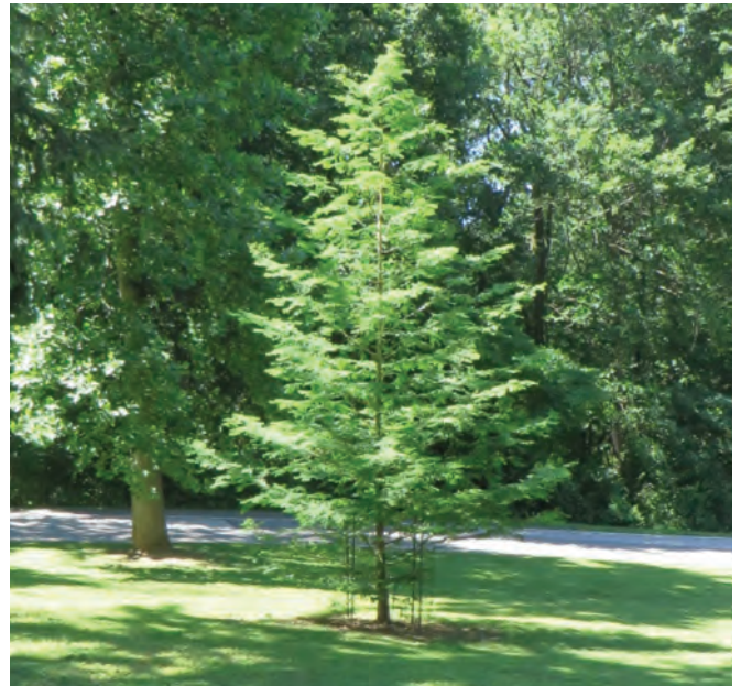
Dawn Redwood 5 years later 30 ft high - 2018