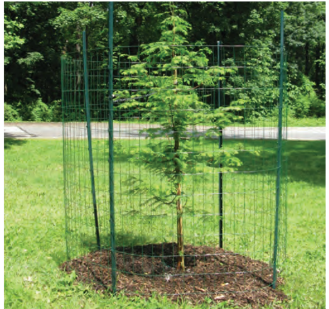
Dawn Redwood - 5 ft high when planted in 2013