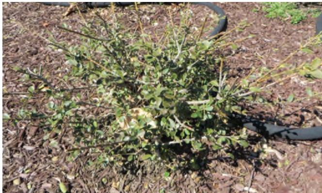
Holly plant in late winter

With the wet cool weather of the past couple of months, the Friends of Oakbourne (FoO) work in the park has been somewhat curtailed. But the wet weather has certainly been a boon to all of the flora and fauna in the park, especially to all of the trees and plants (the Clock Garden hollies, barberries, and roses as well as the 19 trees along the park entry road) that FoO planted in 2017. The only plants that did not make it through the winter were two knockout rose plants in the Clock Garden, which now have been replaced. You may remember a picture from the previous Gazette showing one of the bedraggled Clock Garden holly plants that had been damaged by the harsh winter and deer, but compare it to a recent picture of the vigorous holly after all of the rain and a little Holly Tone fertilizer.