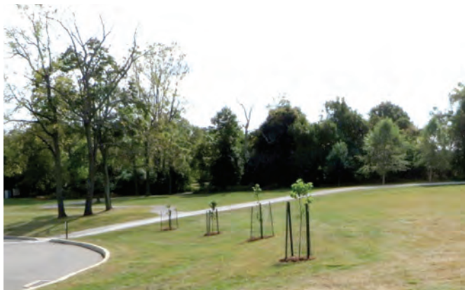
Some park entry drive trees planted fall 2017

And have a look at the entry drive trees when they were planted last fall and now after about 10-12 inches of rain in April/May.