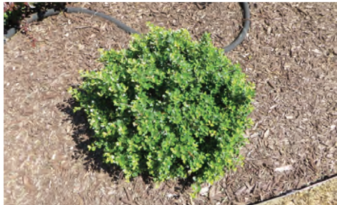
Holly plant in mid-spring

And have a look at the entry drive trees when they were planted last fall and now after about 10-12 inches of rain in April/May.