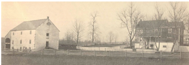
Westtown Gristmill and Miller's House, circa 1900. The mill is gone, but the house still exists on Westtown Rd.

A stone gristmill was built in 1801, a major purpose being to supply flour for the school, from wheat grown on the property. In 1839, a sawmill was added to it. The mill incorporators (who were also school committee members) were permitted to use timber and stone from the School property in building the mill and a house for the miller. The Westtown gristmill ceased operation in 1914, was converted to a community center in 1924, the was demolished in the early 1970's. The millers house still serves as a residence (recently renovated), at the sharp bend in Westtown Road, across from the farmhouse and growing fields.