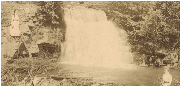
Westtown School Mill Dam, circa 1902, with two women, likely students.