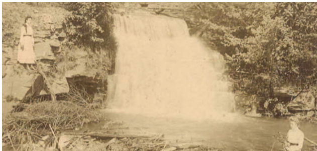
Westtown School Mill Dam, circa 1902, with two women, likely students.