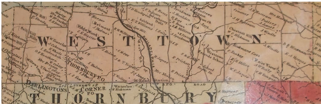
1860 Map showing many streams in Westtown Township, and Hawley-Williams sawmill, pond & millrace, just above the first T in Westtown.