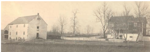
Westtown Gristmill and Miller's House, circa 1900. The mill is gone, but the house still exists on Westtown Rd.

A stone gristmill was built in 1801, a major purpose being to supply flour for the school, from wheat grown on the property. In 1839, a sawmill was added to it. The mill incorporators (who were also school committee members) were permitted to use timber and stone from the School property in building the mill and a house for the miller. The Westtown gristmill ceased operation in 1914, was converted to a community center in 1924, the was demolished in the early 1970's. The millers house still serves as a residence (recently renovated), at the sharp bend in Westtown Road, across from the farmhouse and growing fields.