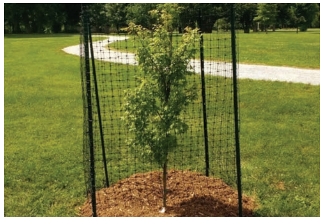
Japanese Coral Maple