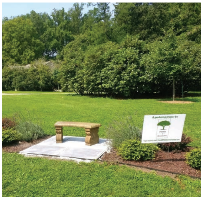
The first of four stone benches to be installed in the Clock Garden

Three dedicated trees have been planted since the last Gazette was printed. Two trees were dedicated by Levante Brewing Company in the name of their customers who patronized a "Growing Green" event on St. Patrick's Day at their brewery in West Chester (208 Carter Drive, Suite 2). Levante wanted to honor and partner with a local park conservation group and the Friends of Oakbourne was the fortunate recipient of their generous contribution. The two trees planted for Levante in the Bark Woodlet area were a Persian Ironwood ( parrotia persica 'Vanessa') and a Japanese Coral Maple ( acer palmatum 'Sango-Kaku'). Recall that trees in the Bark Woodlet area of the arboretum have unique and unusual bark as a notable feature.