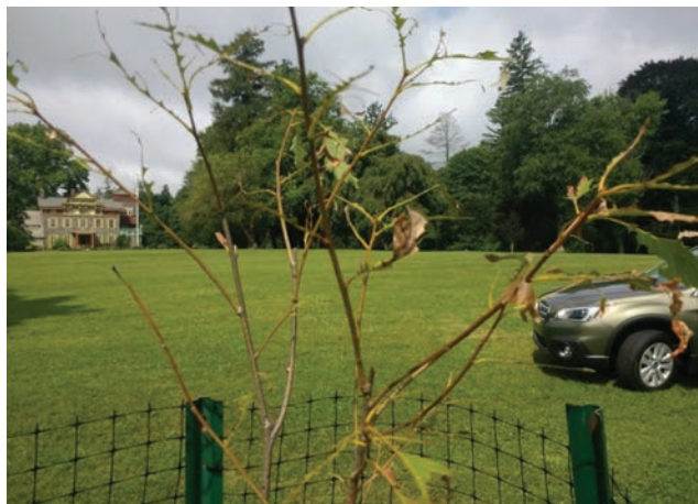
Insect damage to Chestnut Oak

As part of FoO's Clock Garden renovation, we plan to install four commemorative stone benches on flagstone pads, one in each quadrant of the garden. To do this, we dug out the soil 6 inches deep in four 5 foot x 5 foot squares in each quadrant. Each square area was surrounded by metal edging to confine the approximately 1000 pounds of stone dust that was added to each area to provide a sound base for the large flagstones (a total of 2000 pounds) on which the stone benches will be placed. At the time of this writing, all of the flagstone pads have been prepared and installation of the stone benches has begun. We plan to anchor the benches to the flagstone with heavy duty construction adhesive.