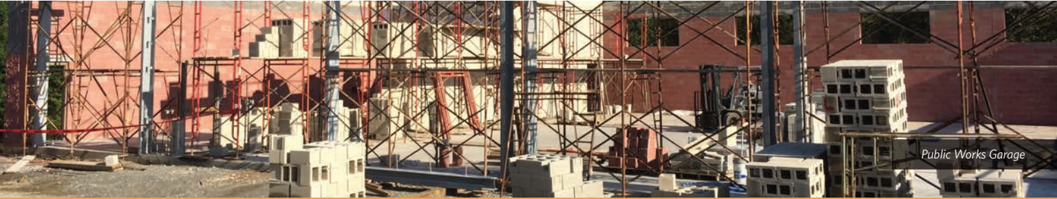
Public Works Garage

A Quarterly Newsletter to the Citizens of Westtown Township - Fall Issue #27