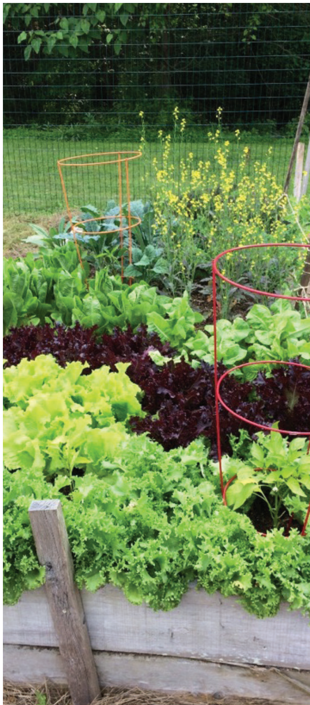
A bountiful Community Garden box.