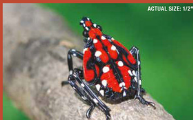
ACTUAL SIZE: 1/2"