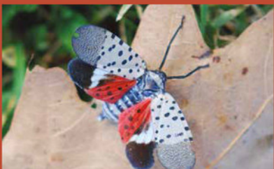
Adult (with wings open) can be found July–December