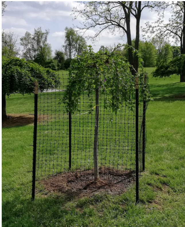
Snow Fountain Weeping Cherry dedicated to Beth Ann Larson Heath

All of these dedicated trees were all obtained from a nursery that uses the "grow bag" method of growing trees. This is the first time FoO has experienced this type of nursery stock and we will be interested to see how these trees grow compared to all of our previously obtained trees that were grown in plastic containers or obtained with a balled & burlapped root ball. The grow bag method involves growing trees in fabric containers in the ground or in plastic containers. This method of growing produces relatively small, uniformly sized root balls with thousands of fine root tips supposedly enabling higher transplant success and grow rates. Grow bag trees are easier to handle compared to balled & burlapped trees which can weigh 400 -500 pounds, and also usually do not have circling roots often observed in plastic container grown trees. Stay tuned for updates on the growth of these trees.