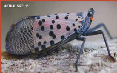
ACTUAL SIZE: 1"