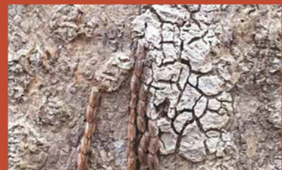
Egg mass (older) can be found January–June