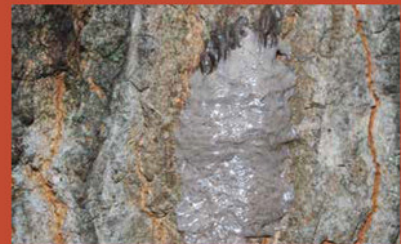
Egg mass (fresh) can be found October–December