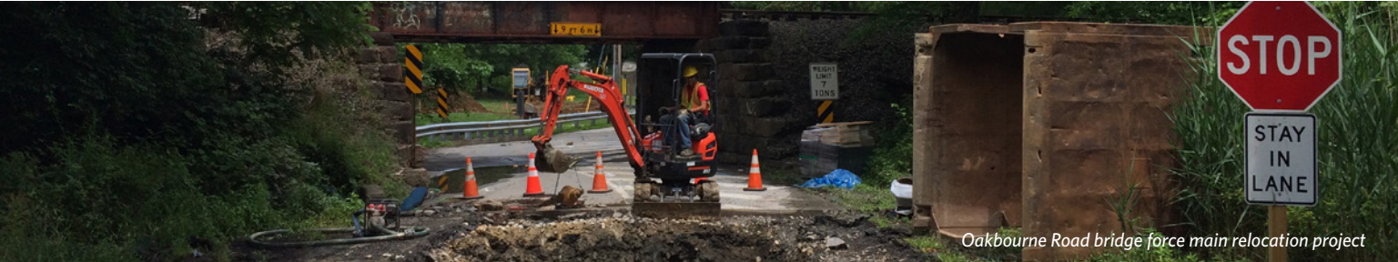
Oakbourne Road bridge force main relocation project

A Quarterly Newsletter to the Citizens of Westtown Township - Summer Issue #30