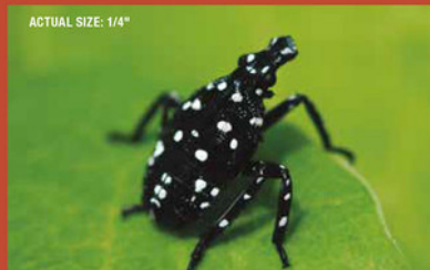
ACTUAL SIZE: 1/4"