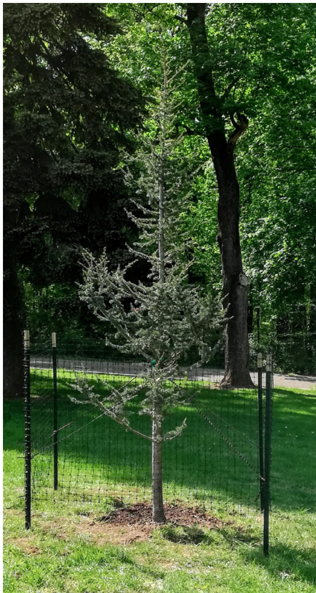
Blue Atlas Cedar Dedicated to Milton B Helmuth

A Blue Atlas Cedar tree ( Cedrus atlantica 'glauca'; GPS: 39.93831002, -75.57300004) dedicated to Milton B. Helmuth by his family was planted in the first grouping of conifers encountered on the right side of the drive as you enter the park. Milton served the township in several capacities and was especially fond of the Oakbourne Mansion. Right now the tree is a gangly youngster about 13 feet high, but it will increase in character as it ages, with beautiful silvery blue foliage and a pyramidal shape that can reach a height of 60 feet and a width of 30 to 40 feet.