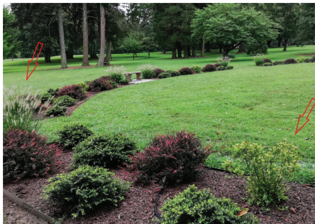
Clock Garden with Newly Planted Gold Mound Spirea (bottom right) and Fountain Grass (middle left)

In the last Gazette, I mentioned that virtually all of the lavender and roses in Oakbourne Mansion's recently renovated Clock Garden had succumbed over the winter, most likely due to the extremely wet conditions experienced throughout the previous year. The Friends of Oakbourne (FoO) removed all of these plants, and have now replaced them with different, more robust plants that will be more tolerant of both wet and dry conditions. The lavender was substituted with a dwarf fountain grass, Pennisetum alopecuroides 'Hameln,' which grows in 2-3' tall clumps and develops showy bottle brush-like flower spikes that arch gracefully out from the grass mound similar to water spraying outward from a fountain. The roses were substituted with gold mound spireas, Spiraea japonica 'Gold Mound,' which is a small shrub that has beautiful golden leaves in the spring that turn chartreuse as summer progresses and then a beautiful yellow tinged with orange/red in the fall. Tiny pink flower clusters (corymbs) that attract pollinators appear on this shrub in the spring.