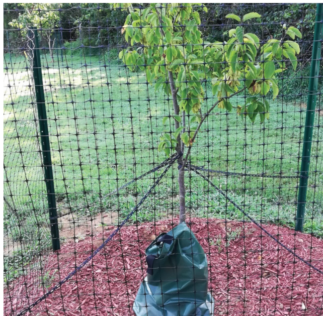
Jersey Belle Carolina Silverbell with a Water Bag

During one of the nasty localized storms we've experienced this spring and summer, one of our dedicated trees (a Carolina silverbell) planted in 2015 was shredded and snapped into multiple pieces by a particularly vicious wind storm. This tree had grown quickly (perhaps too quickly!) into a beautiful specimen; the tree had a very dense round tree canopy and I believe this contributed to its susceptibility to the wind being able to shred this tree while young neighboring trees escaped damage. Keeping this in mind, FoO was able to obtain and plant an alternate cultivar of a Carolina silverbell ( Halesia Carolina 'Jersey Belle'; GPS: 39.93609440, -75.57218987) that will grow in a more upright or columnar habit and perhaps be a bit more resistant to wind shear than the dense rounded habit of the previous variety.