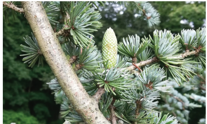
Blue Atlas Cedar Cones

And finally, I've received numerous calls from concerned park users regarding the presence of the pesky invasive spotted lanternfly (SLF) in the park. People have reported seeing the immature lanternfly nymphs and fully developed adults. So far (9/2/2019) I've personally seen the adult lanternfly in only one area of the park - the wooded area between the playground area and Kerwood Road. In this area, there is a grouping of several large invasive Trees-of-Heaven ( Ailanthus altissima ; FYI, this is the tree featured in the novel "A Tree Grows in Brooklyn"), the preferred host for the SLF. These trees act as magnets for the SLF and there were hundreds, maybe thousands, of them on the trunks of these trees. Chester County is one of 13 Pennsylvania counties under a SLF quarantine. For detailed information on how to manage the SLF go to the link: https://extension.psu.edu/spotted-lanternfly . This web site has pictures of the various stages of the SLF's life cycle and provides a summary of methods to control this pest, which threatens Pennsylvania agriculture as well as homeowner's trees and plants.