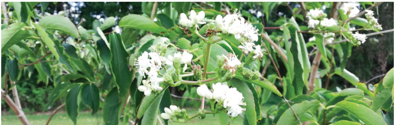
Flowers Blooming in Late Summer on Seven Sons Flower Tree