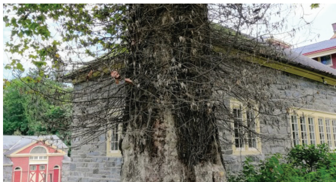
Euonymyous 1 year after the "cutting"

During the coming year, FoO is hoping to design and plant a garden bed that will beautify the back entrance of Oakbourne Park's water tower. The area is devoid of any interesting vegetation. A garden of various shrubs and perennials should significantly enhance the beauty of this neglected area of the water tower.