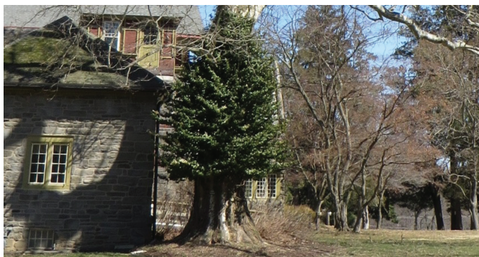
London Plane Euonymyous before the "cutting"

In a previous Friends of Oakbourne (FoO) News article, I described an old euonymus vine that over many years had established itself by encircling the lower portion of Oakbourne Arboretum's magnificent London Plane tree (the second largest tree of its kind in Pennsylvania!) located next to Oakbourne Mansion. In consulting with Longwood Gardens and Bartlett Tree experts, I received recommendations from both that the euonymus vine should be removed for the continued health of the tree. In the fall of 2019, Rick Brown and I cut out 4 foot long sections of the lower stems of the vine with the intention of allowing the vine to slowly desiccate over a year or two so that it might easily be removed without damage to the tree. It's been a little over a year and as you can see from the photo, the vine has indeed dried out and we intend to try removing the brittle remains in the spring.