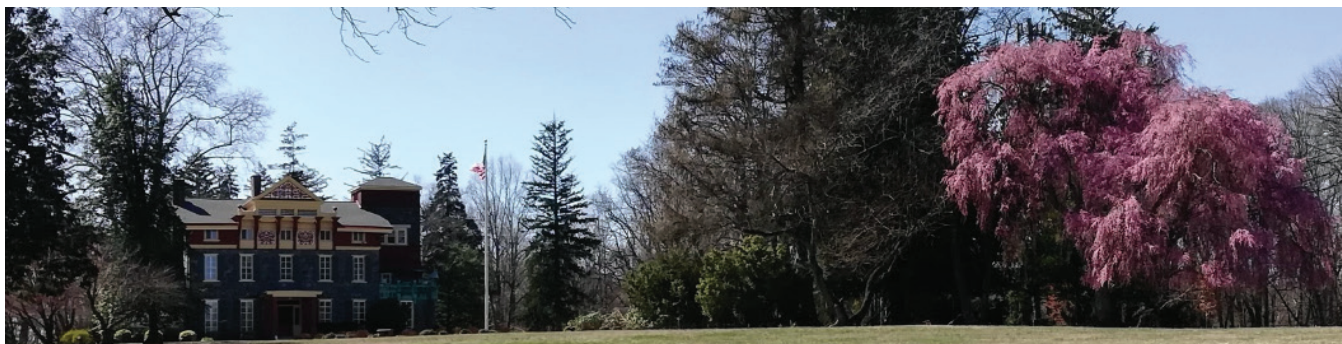
Oakbourne Mansion in the Spring