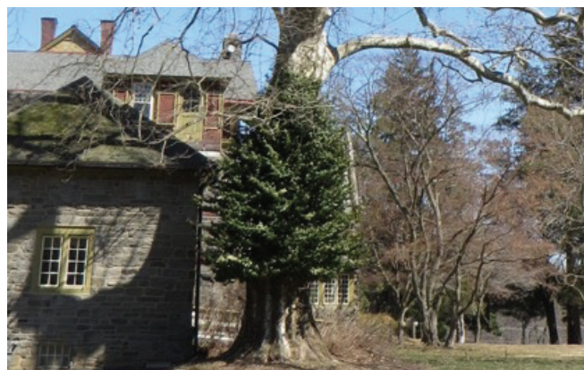
London Plane Tree with Euonymus (2019)