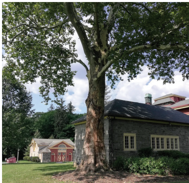
London Plane Tree - Euonymus Removed (2021)