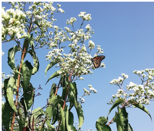
Monarch butterfly on Seven Sons Flower blooms on 8/26/2021 in The Bark Woodlet area of the Arboretum

The Friends of Oakbourne has been designing and planning a low maintenance garden to install at the back side of Oakbourne Park’s beautiful water tower. To prepare the garden, we intend to remove all of the vegetation (mostly grass and a small bed of pachysandra) within the new garden’s boundary during September. Once the vegetation is removed, we hope to plant two small trees and several groupings of deer resistant shrubs by mid-Fall; additional perennials will be planted next spring. More on this garden will be in the next Gazette.