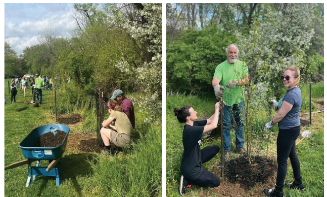
CRC Tree Planting on Blenheim Road

The Township recently installed LED light fixtures in the Township Building. This installation was a recommendation from an energy audit of Township facilities conducted in 2022 by Practical Energy Solutions. As a result of the electricity savings from more efficient LED light fixtures, it is expected that the Township will break even from this project within a few years.