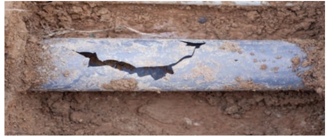
A Ruptured Septic Pipe

The Township requires a Pennsylvania Septage Management Association (PSMA) Certified Inspector to conduct inspections, because they have appropriate training and professional expertise on septic system components and operations. Only a PSMA certified inspector is able to complete a thorough assessment of different types of on lot systems to determine whether repairs are required to bring your system into compliance with all applicable laws, regulations, and standards. The inspector may also provide you with maintenance tips to extend the lifespan of your system.