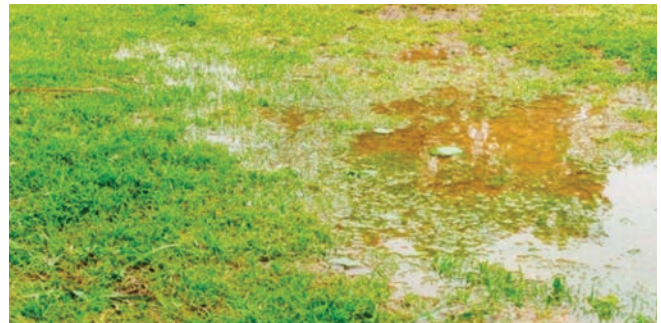
Failed Septic Drain Field